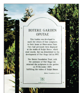
Hotere Garden Opatae. 2005/6 Various artists. Location: top of Constitution St.