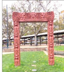
Ko te Tūhono. 2021. Artist: Ayesha Green. Location: Octagon