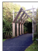
26 has been relocated to Woodhaugh Gardens (near slide and swings)