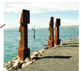
23 no longer exists