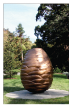
The Cedars of Lebanon Cone. 2012. Collaboration. Note 1 Location: Dunedin Botanic Garden, Cedars of Lebanon Grove

See also- https://ndhadeliver.natlib.govt.nz/webarchive/20161216210055/http://www.ost-sculpture.org.nz/